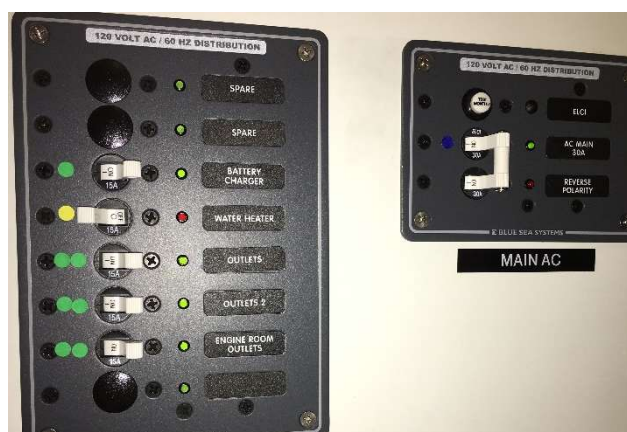
A/C Electrical Control Panel Main AC Panel