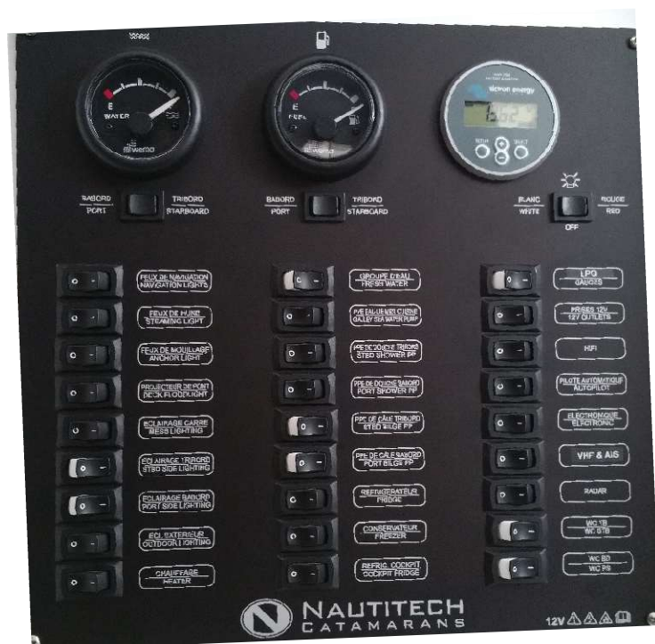
DC Electrical Panel