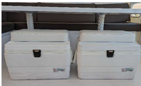
COCKPIT COOLERS with CUSTOM CUSHIONS