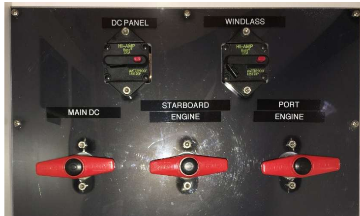
DC Battery Panel