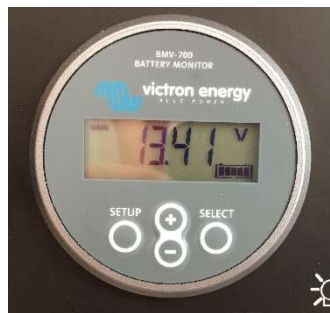
Victron Energy Monitor