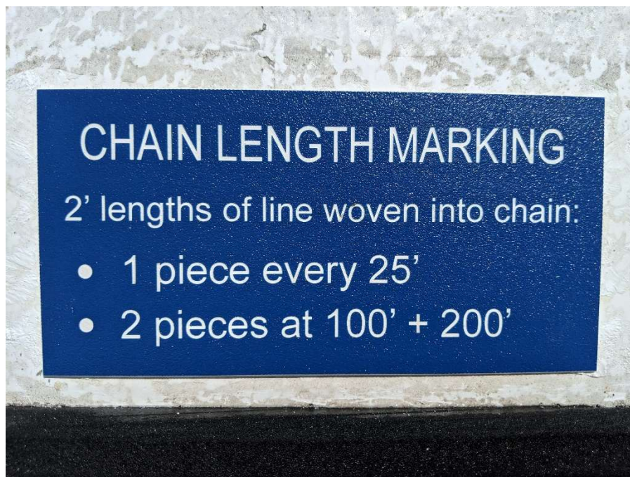
ANCHOR CHAIN PLACARD – ANCHOR LOCKER LID