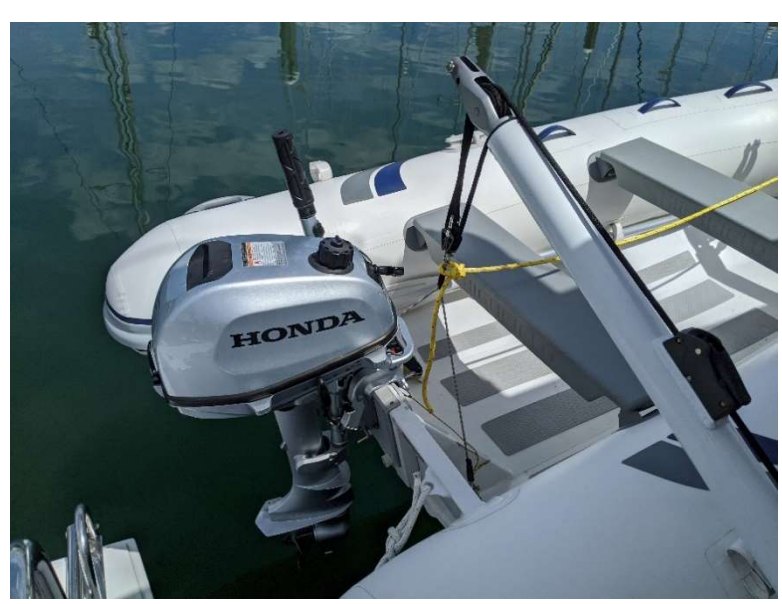
OUTBOARD STAYS ON DINGHY